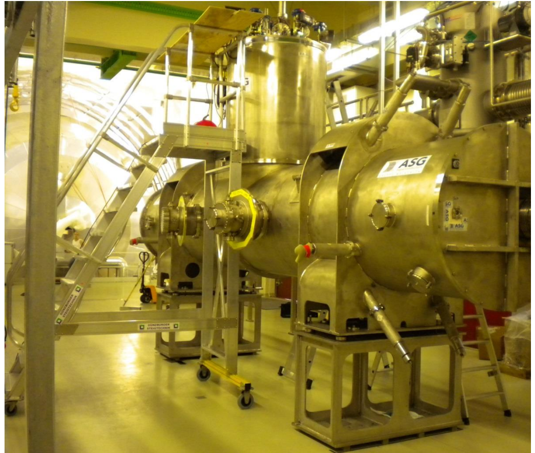
KATRIN DPS2-F at KIT