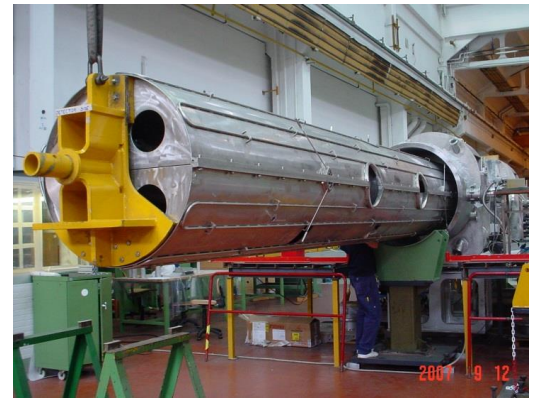
DPS2-F System for KATRIN Experiment Blank assembly of cold mass inside vacuum chamber